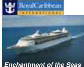
Enchantment of the Seas

CRUISE GREECE TO SPAIN November 6 to November 13, 2023 Refundable deposit: $500.00 per cabin - Final payment: August 8, 2023 ★ Oceanview cabin for 2 - $1826.98 ★ Interior cabin for 2 - $1376.98 For more information call: Joan Sabino -281-298-6683 Lynn Parisi - 727-647-8778 or Kristi Goodman 281-253-9655 - (Travel Agent) or Email: kristigoodman@cruiseplanners.com